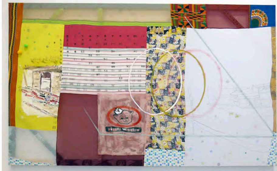
Tameka Norris, 12 Times Table , 60 x 100 in, 2014